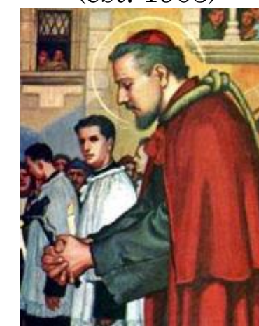
November 4 Patron of Seminarians and Catechists

Oh God, Maintain in your people that spirit with which you inspired your Bishop St. Charles, so that your church may be constantly renewed, conforming itself to Christ and manifesting Christ to the world.